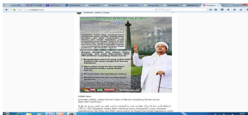
Figure1. The Selection of Chosen Media